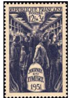
Railway Mail Sorting Car, France

Our April meeting was well attended with one of the most successful auctions for some time. 60 lots were offered of which 58 sold with some spirited bidding taking many of them well above the reserve to a total sales of $465. One member commented that there was a lot less common material for sale so perhaps this is why bidding was so keen.