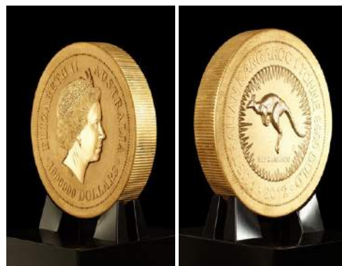
The Australian coin