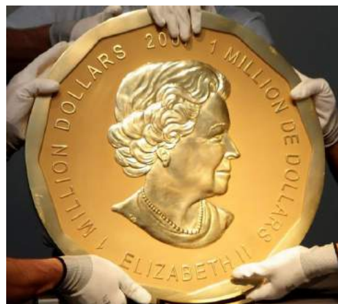
The stolen coin seen above hasn't shown up on eBay yet.

http://www.perthmint.com.au/1-tonne-gold-coin.aspx