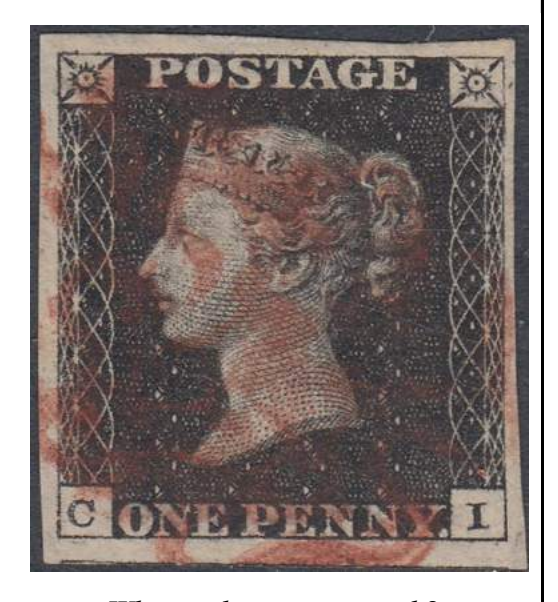
What is this stamp worth?

Perhaps the most important point they make is this quote from Stanley Gibbons. "It is a common fallacy that the prices in our catalogues show what a stamp is 'worth' should you wish to sell it. They are, instead, the price at which Stanley Gibbons will sell a fine example of the stamp in question."