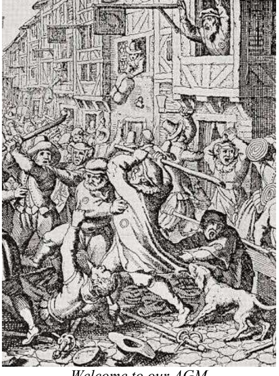
Welcome to our AGM

Finally, a reminder that the $30 membership fees are now due.