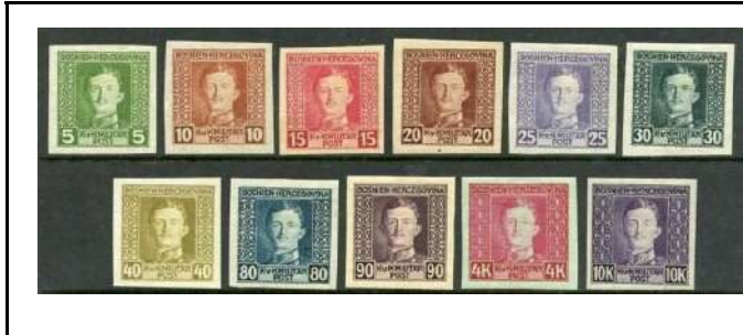
Bosnia No. 13, 1917