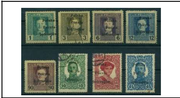
Poland No.'s 26 & 28, 1919