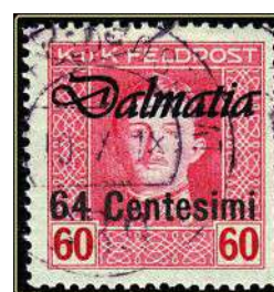
Dalmatia No. 19, 1918