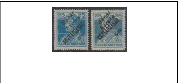
Rumanian OCCUPATION No. 40, 1919