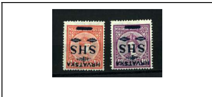
Slovenia, Croatia & Serbia No. 35, 1918