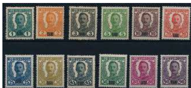
Romania No. 30, 1918