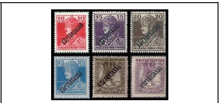
Hungary No. 3, 1918