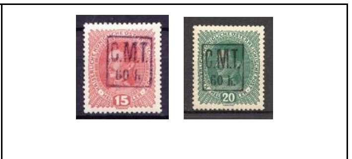
Romanian Occupation Kolomyia No. 43, 1919