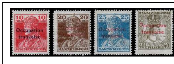
French Occupation No. 37, 1919