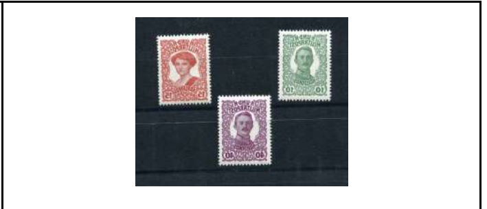
Bosnia No. 14, 1918