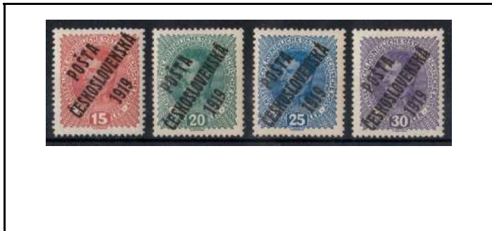
Czechoslovakia No. 16, 1919