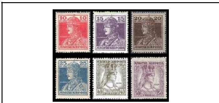
Hungary No. 2, 1918