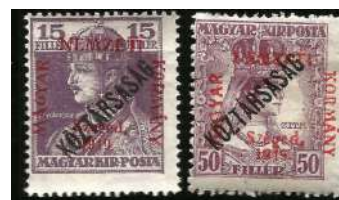
Hungarian National Government No. 5, 1919