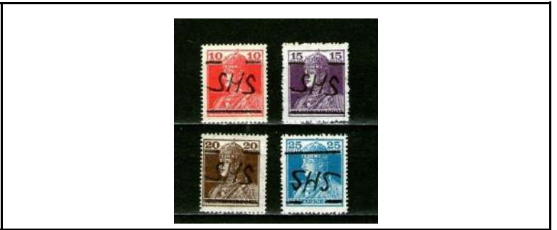
Slovenia, Croatia, & Serbia No. 36, 1918