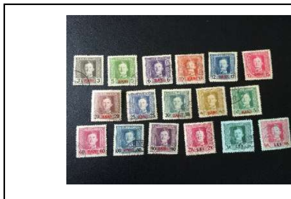
Romania No. 29, 1917