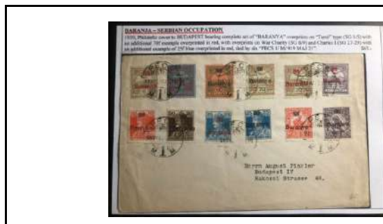
Serbian Occupation No. 44, 1919