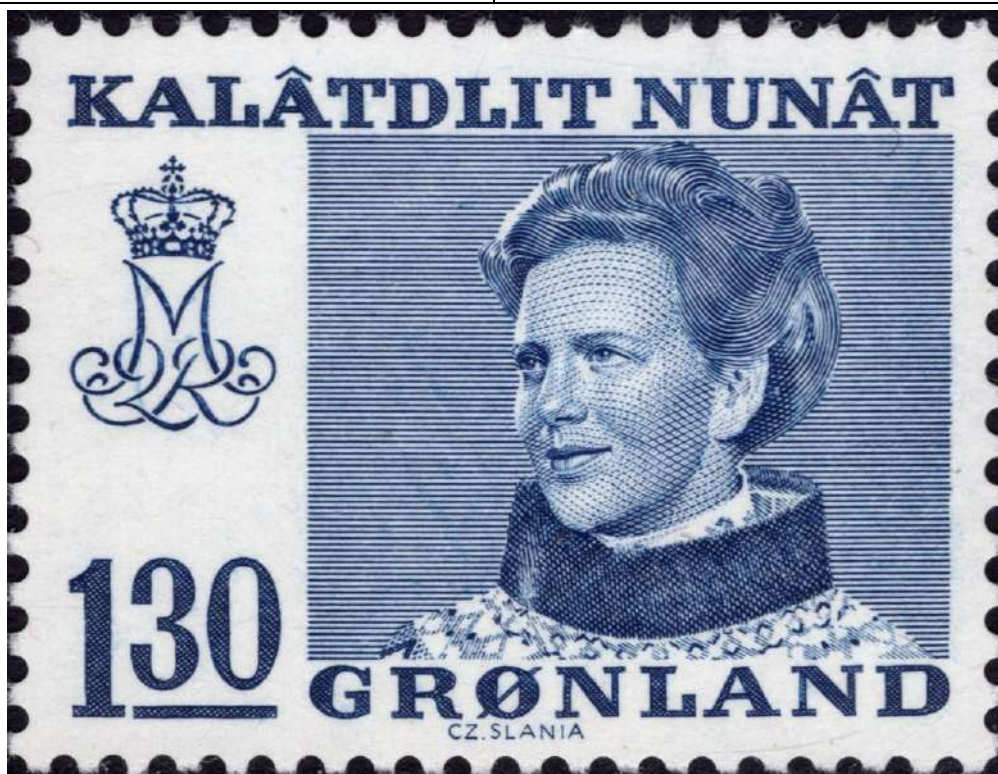
Larger image to show superb engraving by Slania.

In 1978 the new spelling in Greenlandic of Kalaallit Nunaat was introduced. This set shows a portrait of Queen Margrethe.