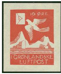
1 st Printing left, 2 nd Printing right.

1931. Known as the ‘Rockwell Kent private airmail’ stamp. Around 200-400 issued ?, w/o gum. Worth around $800 each. Rockwell Kent was an American artist who lived in far Northern Greenland from 1929 to 1932. Kent made these by way of a crude woodblock while on a film-making expedition. They were used on letters flown from his base camp to a working camp. Hard to find.