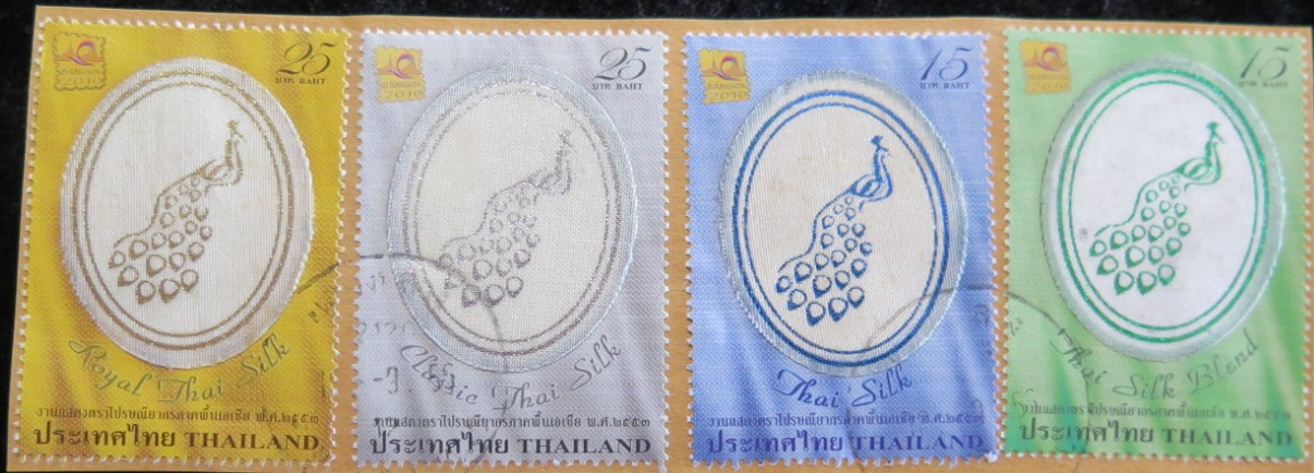
Silk stamps from Thailand