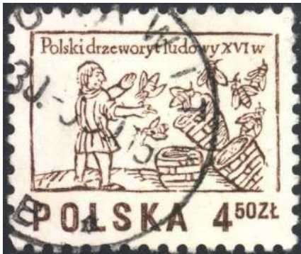
My favourite bee stamp

An exclusion zone was declared around the port. All bees kept within that zone were killed in an attempt to stop the mite from spreading. Outside a further zone was declared where all bees were locked down and transport of hives was forbidden. The problem was that as well as beekeepers' hives, there are many feral colonies and it is almost impossible to find all of these. Add that to the fact that a bee might fly two or three kilometers from the hive in a search for nectar and it has been no surprise that the exclusion zones have been slowly widening. At the moment, they have not reached Victoria but come the Spring, it would be quite possible for a swarm to hitch a ride down on a truck.