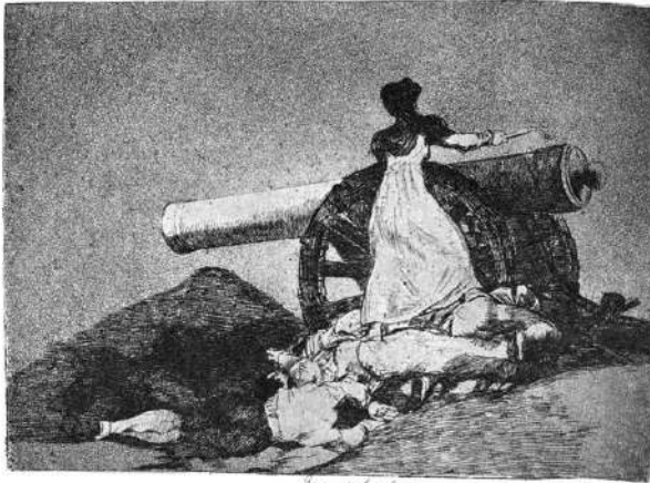
Que valor! a plate in Francisco Goya's series, The Disasters of War

By 1808, Zaragoza was one of the few cities in Spain that had not fallen to the French but on June 15th that year, they made a determined attack on the city gates. When Agustina arrived on the battlements, carrying food for the defenders, she found a scene of carnage with many dead or dying and the remaining soldiers in retreat. Incensed at what she saw, she is said to have flung herself onto a cannon, loaded it and fired it at the advancing French soldiers. They were so surprised to be attacked by this slip of a girl, they pulled back while the retreating Spaniards seeing her actions turned and came back to support her. They won the day but a few weeks later, the French returned and after bloody house-to-house fighting causing many deaths on both sides, the city finally surrendered.