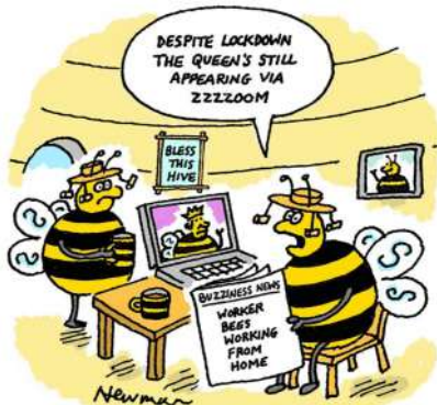
The Times view of the Australian bee lockdown.

Then, a few years ago, the government cut the budget of a million dollars annually, for maintaining the traps at our ports (while at the same time budgeting billions for new submarines that we won't see for decades). This brought howls of outrage from beekeepers, orchardists and farmers who rely on bees to produce our food. A massive petition was sent to Canberra but all these negative reactions were ignored.