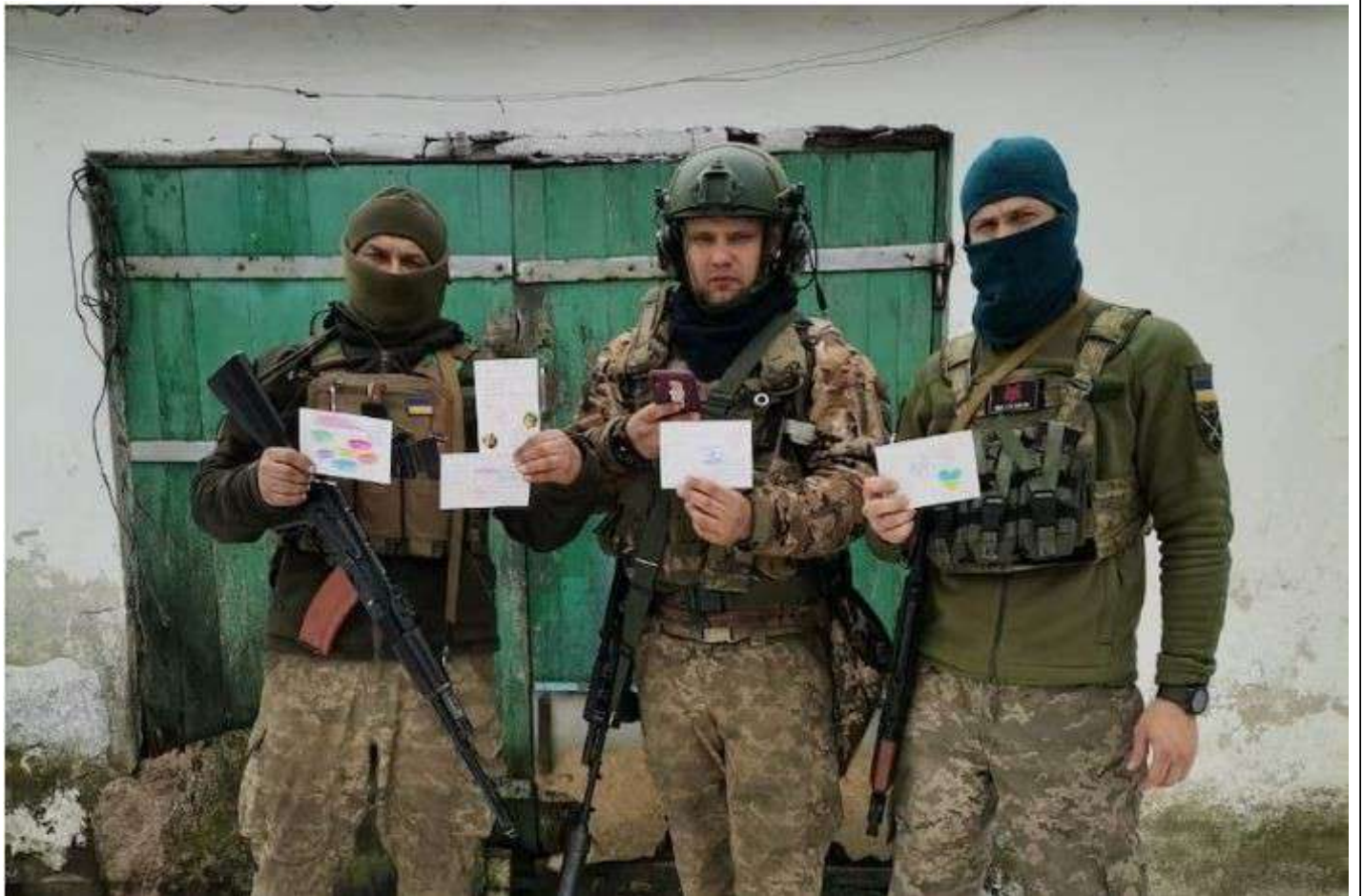
Ukrainian soldiers with some of the postcards they have received.

The full ABC article can be found at www.abc.net.au/news/2023-03-13/postcards-to-the-front-australians-send-messages-ukrainian-troops/102081252?